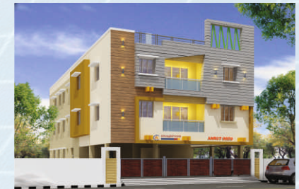
Amrut Orto 1110, 50th Street, Korattur, Chennai-80