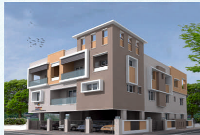
Jagadguru Regalo Door No.17, 7th Street, Poompohar Nagar, Kolathur, Chennai-99.