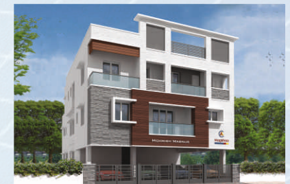
Mohnish Magnus 758, 29th Street, TNHB, Korattur, Chennai-80.

Disclaimer : Whilst reasonable care has been taken in preparing the brochure, constructing the model and the sales gallery show flat (the "Materials"), the developer and its agents shall not be held responsible for any inaccuracies in their contents or between the materials and the actual unit. All statements, literature and depictions in the materials are not to be regarded as a statement or representations of the fact. Visual representation such as layout plans, finishes, illustrations, pictures, photograph and drawings contained in the materials are artist's impressions only and not representation of fact. Such materials are for guidance only and should not be relied upon as accurately describing any specific matter. All information, specifications, plans and visual representations contained in the materials are subject to changes from time to time by the developer and/or the competent authorities and shall not form part of the offer or contract.