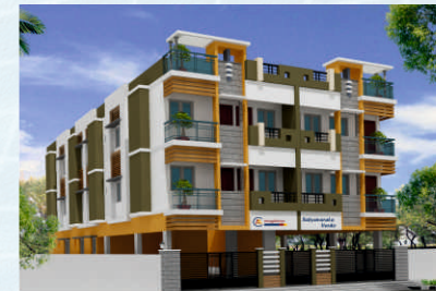
Satyavarta Vasto Citibabu Nagar, Kolathur, Chennai-99.