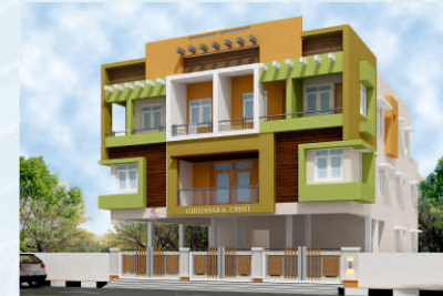
Girdhara Crest 10, Baghavathy Ammal Colony, Kolathur, Chennai-99