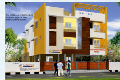
Hiranyagarbha Ortus Sivananda Nagar, 1st Street, Kolathur, Chennai-99