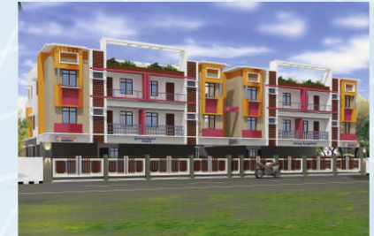
Gyaneshwara Vasta & Srivag Symphony Radha Nagar, Valasaravakkam, Chennai 87.