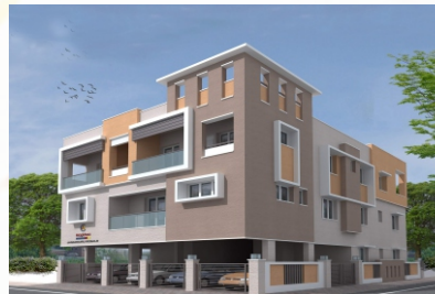
Jagadguru Regalo Door No.17, 7th Street, Poompohar Nagar, Kolathur, Chennai-99.