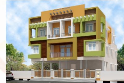
Girdhara Crest 10, Baghavathy Ammal Colony, Kolathur, Chennai-99