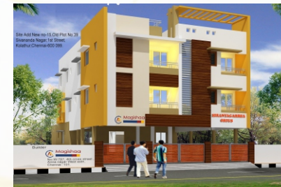
Hiranyagarbha Ortus Sivananda Nagar, 1st Street, Kolathur, Chennai-99