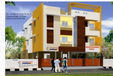
Hiranyagarbha Ortus Sivananda Nagar, 1st Street, Kolathur, Chennai-99