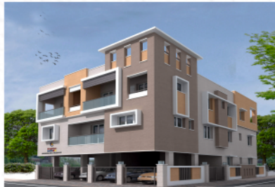
Jagadguru Regalo Door No.17, 7th Street, Poompohar Nagar, Kolathur, Chennai-99.