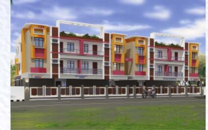
Gyaneshwara Vasta & Srivag Symphony Radha Nagar, Valasaravakkam, Chennai 87.