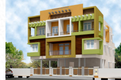
Girdhara Crest 10, Baghavathy Ammal Colony, Kolathur, Chennai-99