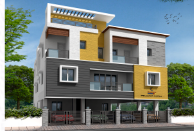
Prajapati Patria # 54, 3rd Street, Poombugar Nagar, Kolathur, Chennai-99.